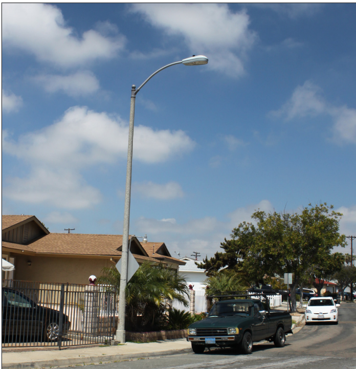
A recently installed streetlight.

After all trenching operations have been completed by our contractor, the cabling portion of the work will begin. Another contractor will perform the cabling work. Cabling involves technicians placing new utility lines in the new conduits, so that the new lines can be "energized" and brought into service. Once the new system has been energized, the process to "cut-over" customers from overhead to underground services will begin. Once customers have been cut-over, the overhead lines will be removed. We anticipate this process will move very swiftly and it's not nearly as disruptive or distracting as the trenching work, which is why you may not even see us working.