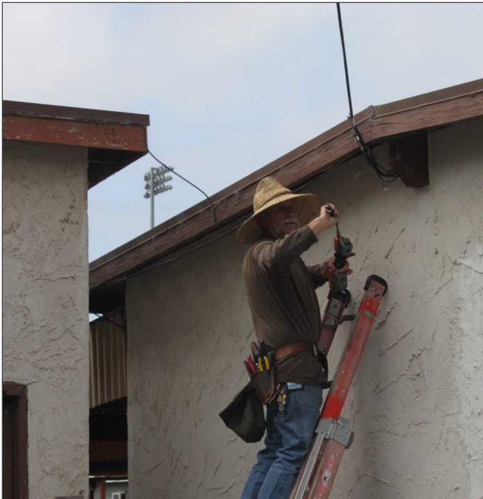
An AT&T crew member works on cut-over activities.

After all trenching operations have been completed by our contractor, the cabling portion of the work will begin. Another contractor will perform the cabling work. Cabling involves technicians placing new utility lines in the new conduits, so that the new lines can be "energized" and brought into service. Once the new system has been energized, the process to "cut-over" customers from overhead to underground services will begin. Once customers have been cut-over, the overhead lines will be removed. We anticipate this process will move very swiftly and it's not nearly as disruptive or distracting as the trenching work, which is why you may not even see us working.