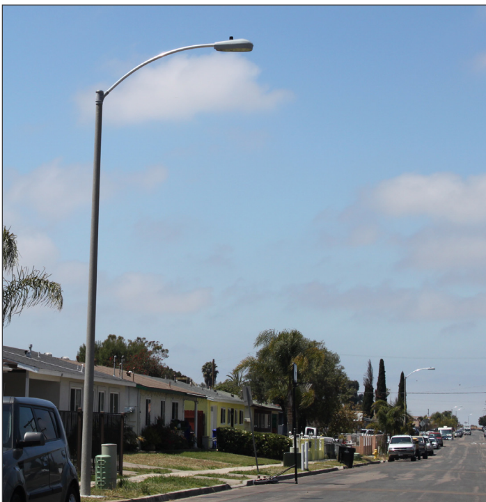
Streetlights continue to be installed throughout the project block, as overhead lines are removed.

After all trenching operations have been completed by our contractor, the cabling portion of the work will begin. Another contractor will perform the cabling work. Cabling involves technicians placing new utility lines in the new conduits, so that the new lines can be “energized” and brought into service. Once the new system has been energized, the process to “cut-over” customers from overhead to underground services will begin. Once customers have been cut-over, the overhead lines will be removed. We anticipate this process will move very swiftly and it’s not nearly as disruptive or distracting as the trenching work, which is why you may not even see us working.