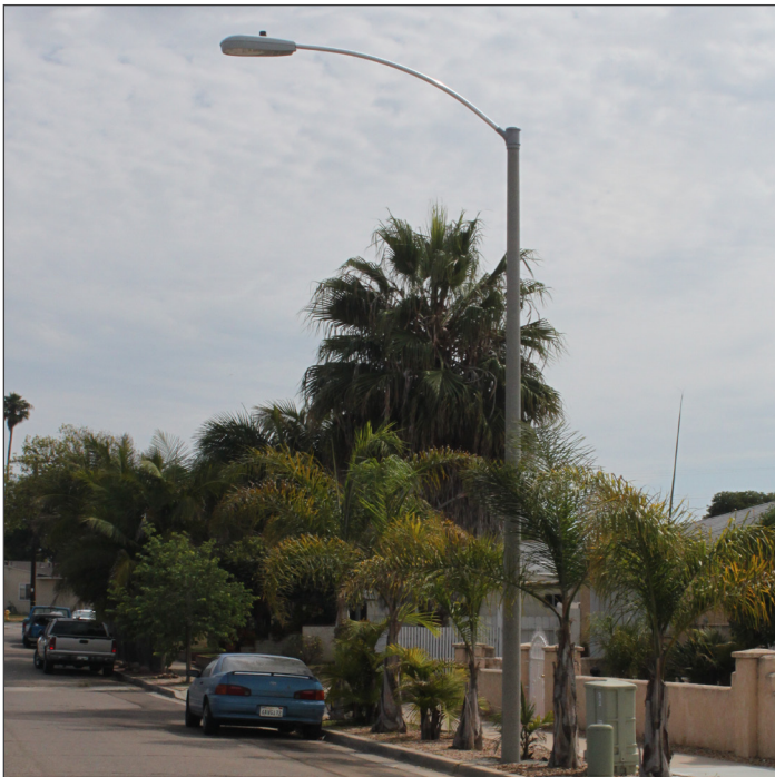
Crews are currently installing and activating new streetlights throughout the project area.

After all trenching operations have been completed by our contractor, the cabling portion of the work will begin. Another contractor will perform the cabling work. Cabling involves technicians placing new utility lines in the new conduits, so that the new lines can be “energized” and brought into service. Once the new system has been energized, the process to “cut-over” customers from overhead to underground services will begin. Once customers have been cut-over, the overhead lines will be removed. We anticipate this process will move very swiftly and it’s not nearly as disruptive or distracting as the trenching work, which is why you may not even see us working.