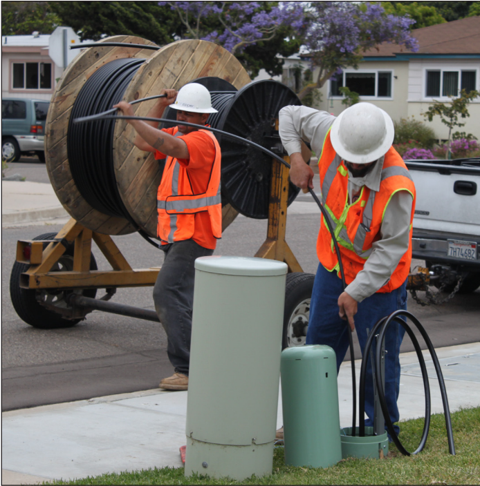
Crew members install underground utility cables.

All panel and trenching work is complete. If you have any questions or concerns about the electrical or trenching work completed on your property, please do not hesitate to contact the contractor listed on the door hanger we left at your property.