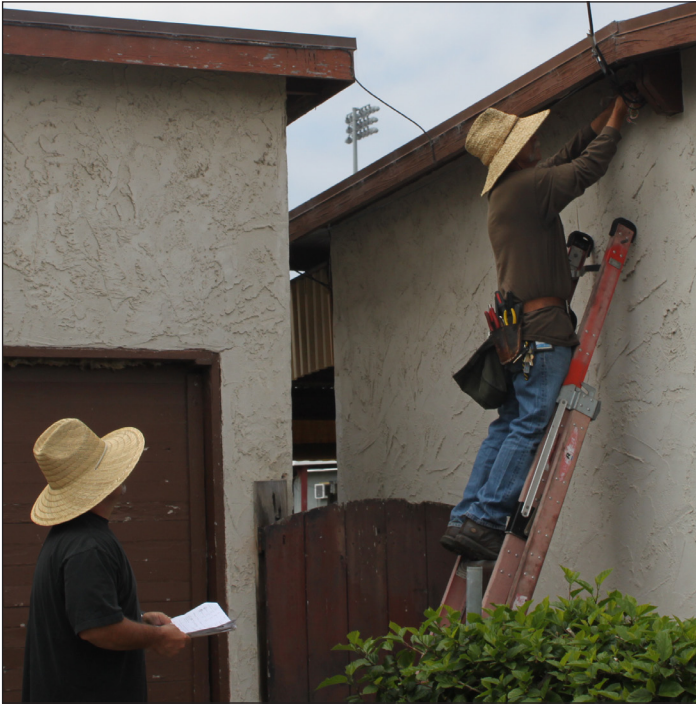
AT&T crew members work to complete cut-over activities on a customer's home.

All panel and trenching work is complete. If you have any questions or concerns about the electrical or trenching work completed on your property, please do not hesitate to contact the contractor listed on the door hanger we left at your property.