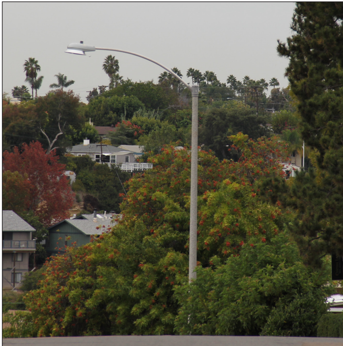
Crews will start installing streetlights, like the one pictured above, this month.

All panel and trenching work is complete. If you have any questions or concerns about the electrical or trenching work completed on your property, please do not hesitate to contact the contractor listed on the door hanger we left at your property.