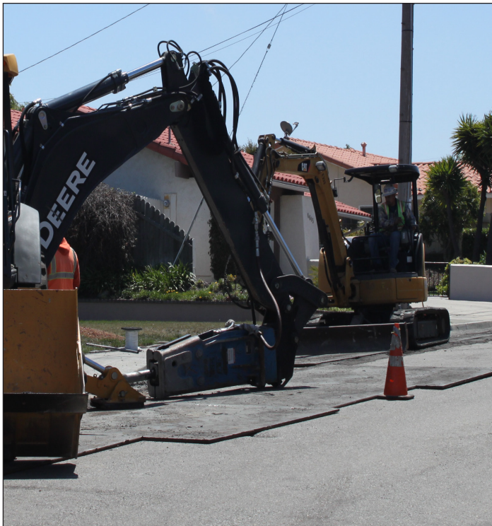
Trenching crews must use a hydraulic breaker, pictured above, to break through the blue granite that is present under the roadway.

Cabbling involves technicians placing new utility lines in the new conduits, so that the new lines can be “energized” and brought into service. Once the new system has been energized, the process to “cut-over” customers from overhead to underground services will begin. Once customers have been cut-over, the overhead lines will be removed. This process is not nearly as disruptive as the trenching work, which is why you may not even see us working. A door hanger will be left prior to the contractor visiting your property.