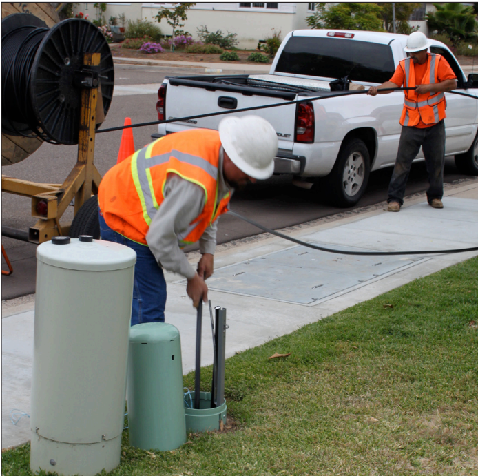
With utility pedestals in place, crew members pull cabling through the new underground conduit lines. This work prepares the switch over from the overhead system to the underground system.

Trench work is 100% complete in Project Block 8G.