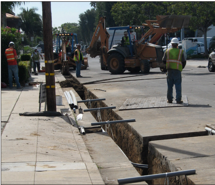
Crew members dig a mainline trench and install underground conduit lines.

You have likely seen trenching crews working in the streets. Trench work is approximately 15% complete in Project Block 4Z. We ask for your patience as they complete this work, as it can be disruptive and distracting. Approximately two weeks prior to the start of the trench work on your property and in the street, you will receive a door hanger with the trenching contractor's name and phone number on it. If you have any questions or concerns about the work, please do not hesitate to contact the contractor.