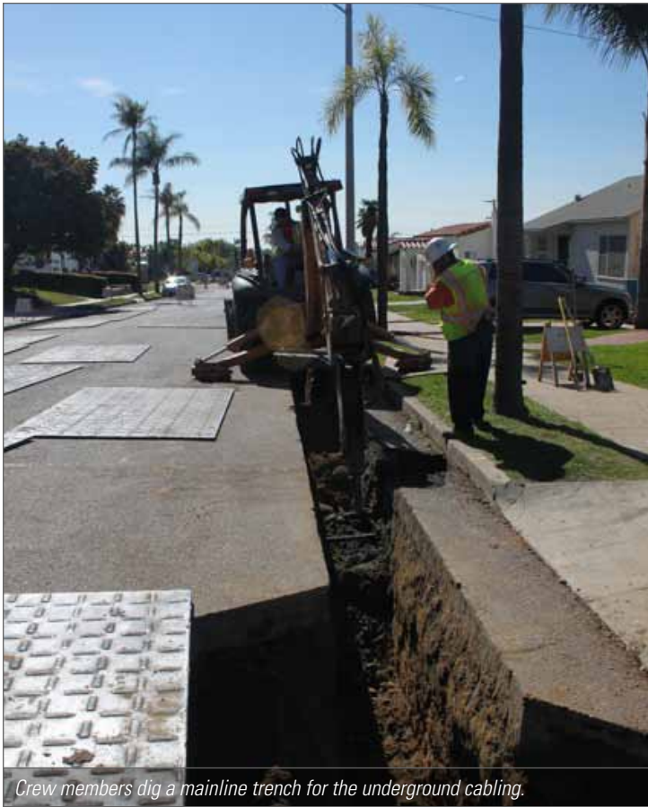
Crew members dig a mainline trench for the underground cabling.