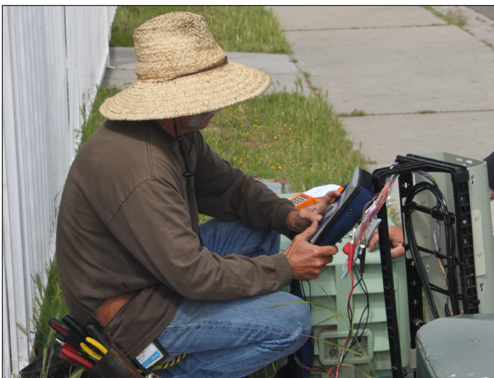
In order for the overhead lines to be removed, an AT&T crew member confirms that services have been switched from the overhead lines to the underground system.