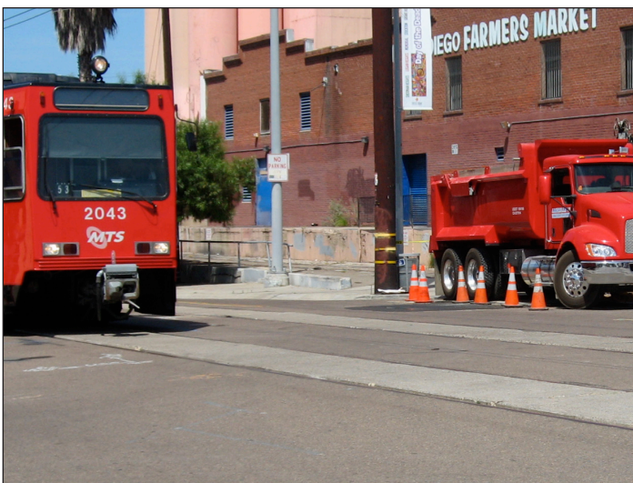
Undergrounding crews work along side the MTS Trolley line to install an underground electrical vault.