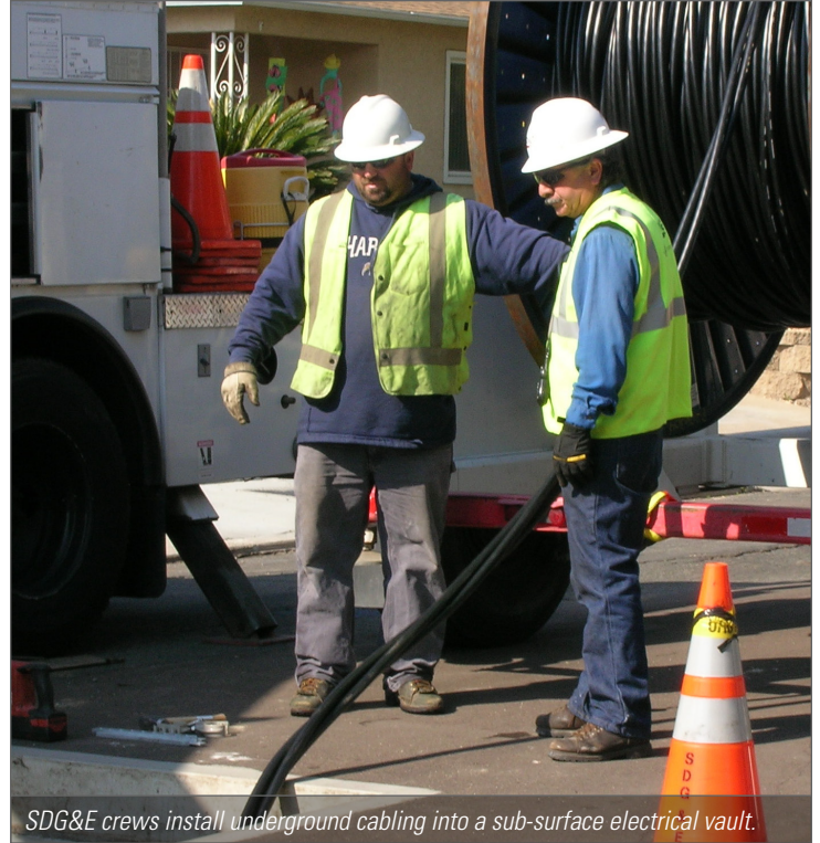
SDG&E crews install underground cabling into a sub-surface electrical vault.

CORRECTION NOTICES ➤ If you need to make a correction to your property in order to pass final inspection, you will receive a door hanger or letter from a City of San Diego inspector. The door hanger and letter have a description of the correction needed. Please do not delay in contacting the inspector whose name and phone number appear on these notices, so that the problem can be resolved.