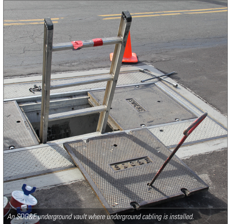
An SDG&E underground vault where underground cabling is installed.

CORRECTION NOTICES ➤ If you need to make a correction to your property in order to pass final inspection, you will receive a door hanger or letter from a City of San Diego inspector. The door hanger and letter have a description of the correction needed. Please do not delay in contacting the inspector whose name and phone number appear on these notices, so that the problem can be resolved.