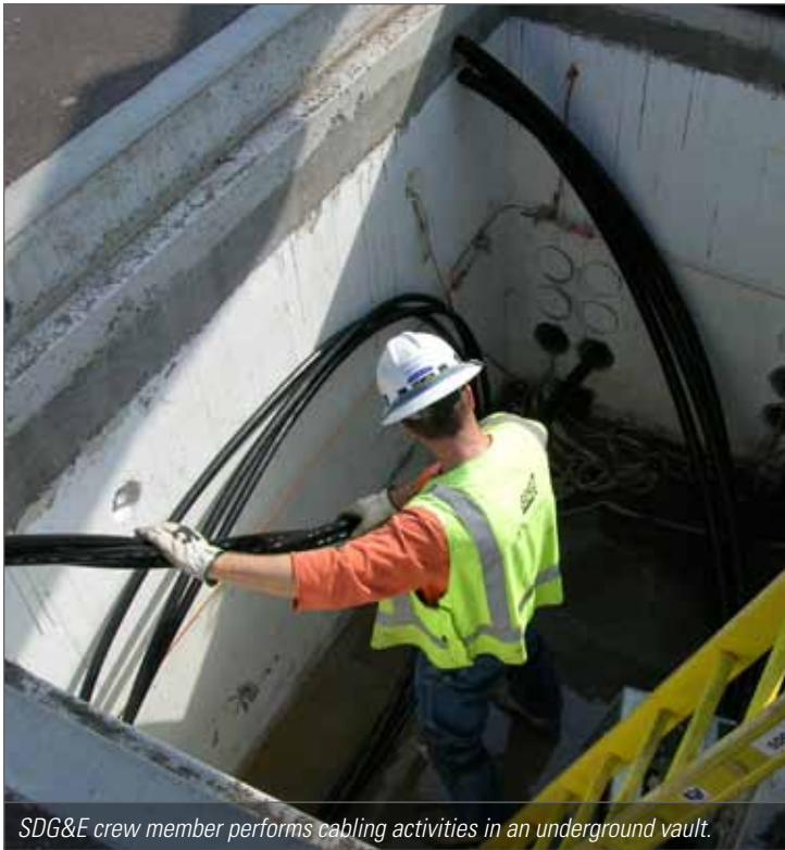
SDG&E crew member performs cabling activities in an underground vault.