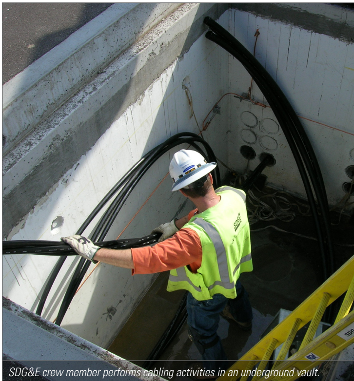
SDG&E crew member performs cabling activities in an underground vault.