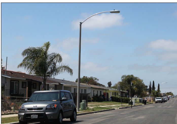
Streetlight installation continues to take place throughout the project block.