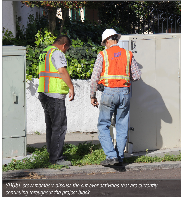
SDG&E crew members discuss the cut-over activities that are currently continuing throughout the project block.

CORRECTION NOTICES › If you need to make a correction to your property in order to pass final inspection, you will receive a door hanger or letter from a City of San Diego inspector. The door hanger and letter have a description of the correction needed. Please do not delay in contacting the inspector whose name and phone number appear on these notices, so that the problem can be resolved.