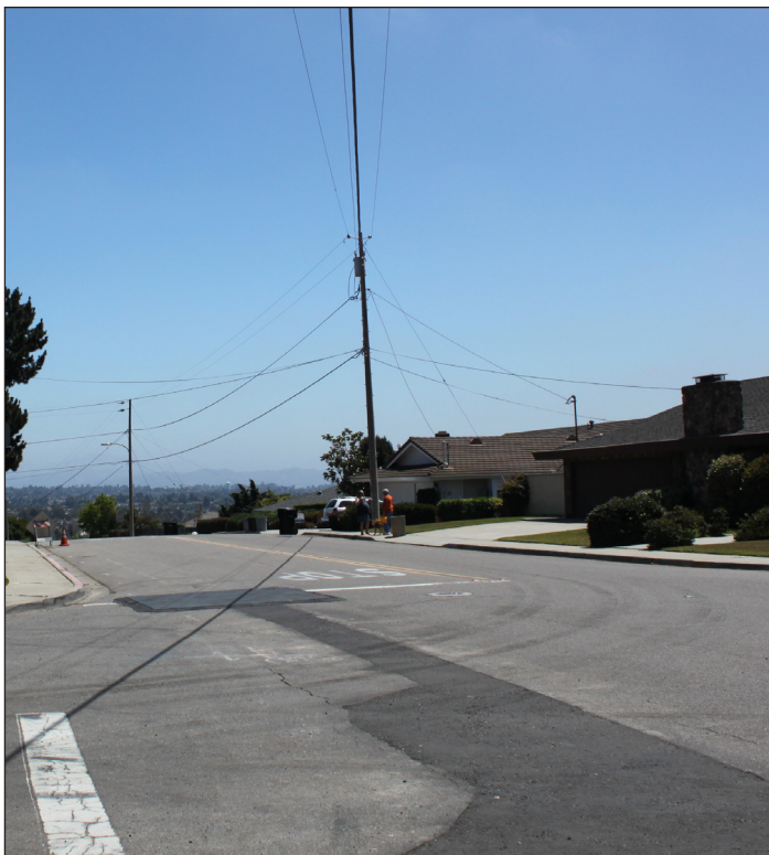
Trench caps, which seal the underground conduit lines underground, were recently installed, signifying the completion of the trenching activities.

Cabbling involves technicians placing new utility lines in the new conduits, so that the new lines can be “energized” and brought into service. Once the new system has been energized, the process to “cut-over” customers from overhead to underground services will begin. Once customers have been cut-over, the overhead lines will be removed. This process is not nearly as disruptive as the trenching work, which is why you may not even see us working. A door hanger will be left prior to the contractor visiting your property.