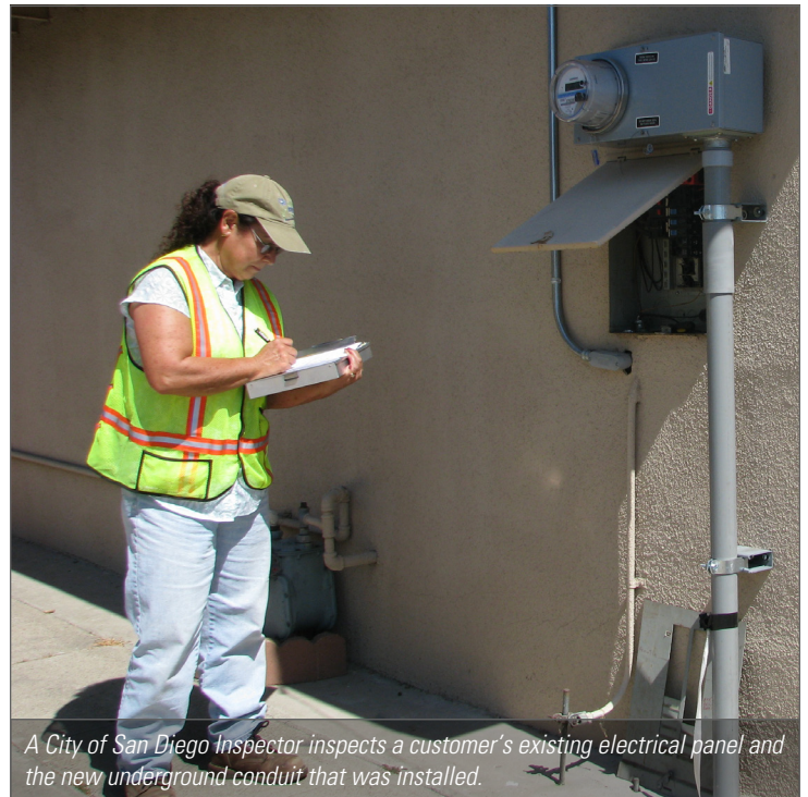
A City of San Diego Inspector inspects a customer's existing electrical panel and the new underground conduit that was installed.

CORRECTION NOTICES ➤ If you need to make a correction to your property in order to pass final inspection, you will receive a door hanger or letter from a City of San Diego inspector. The door hanger and letter have a description of the correction needed. Please do not delay in contacting the inspector whose name and phone number appear on these notices, so that the problem can be resolved.