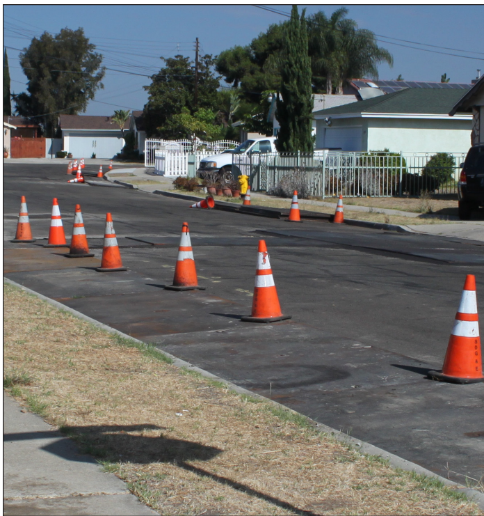
Steel plates temporarily cover the mainline trench while customer service trenches are installed.

Cabling involves technicians placing new utility lines in the new conduits, so that the new lines can be “energized” and brought into service. Once the new system has been energized, the process to “cut-over” customers from overhead to underground services will begin. Once customers have been cut-over, the overhead lines will be removed. This process is not nearly as disruptive as the trenching work, which is why you may not even see us working. A door hanger will be left prior to the contractor visiting your property.