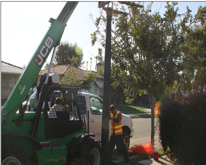
The final acorn streetlights were installed in the project block.

Streetlight installation is 100% complete.