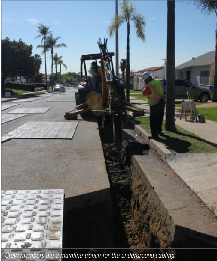
Crew members dig a mainline trench for the underground cabling.