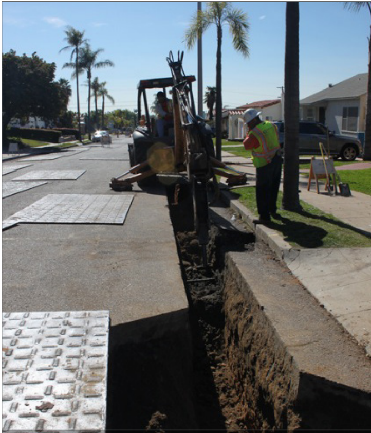
Crew members dig a mainline trench for the underground cabling.