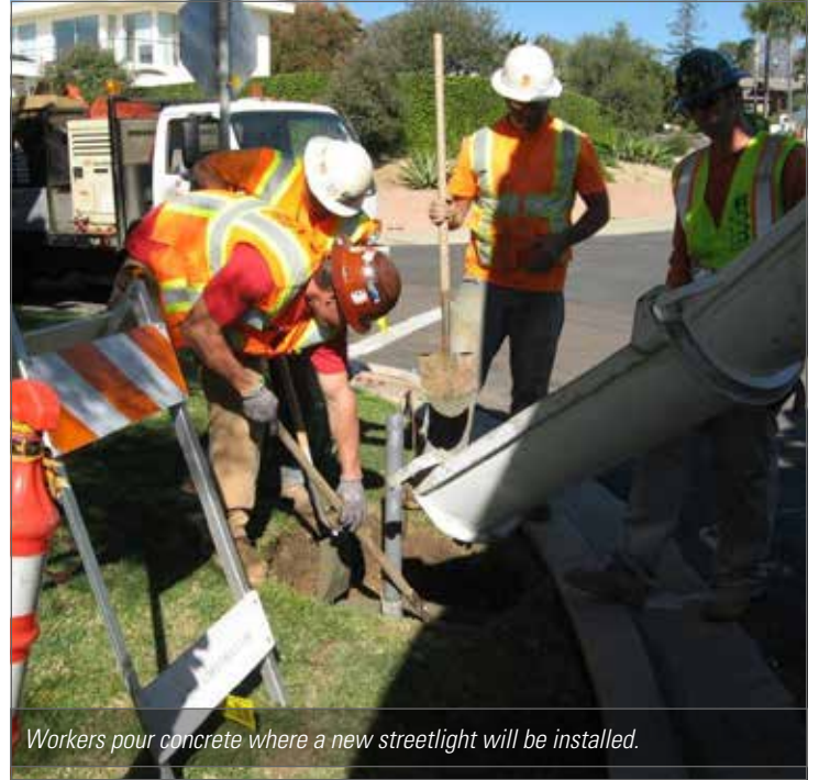
Workers pour concrete where a new streetlight will be installed.

CORRECTION NOTICES ➤ If you need to make a correction to your property in order to pass final inspection, you will receive a door hanger or letter from a City of San Diego inspector. The door hanger and letter have a description of the correction needed. Please do not delay in contacting the inspector whose name and phone number appear on these notices, so that the problem can be resolved.