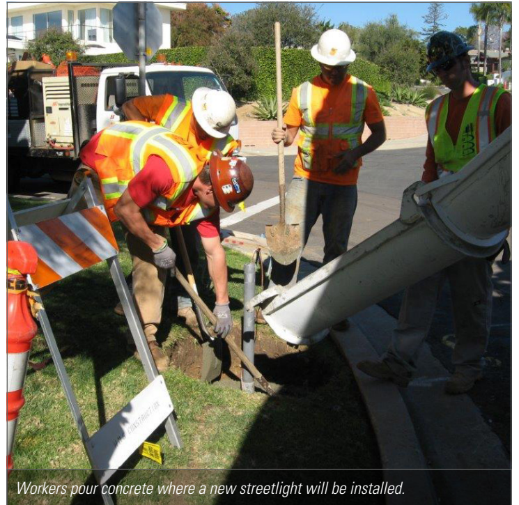
Workers pour concrete where a new streetlight will be installed.

Most of these corrections are minor and are the responsibility of the property owner. Corrections need to be completed before we can cut customers over to the new underground system. Customers who are not cut-over to the new underground system risk loss of service when the overhead system is removed.