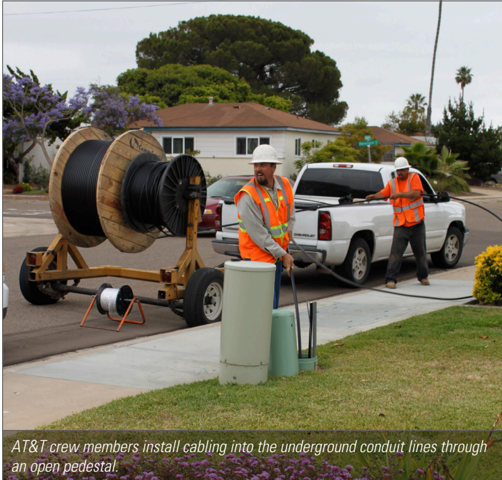
AT&T crew members install cabling into the underground conduit lines through an open pedestal.