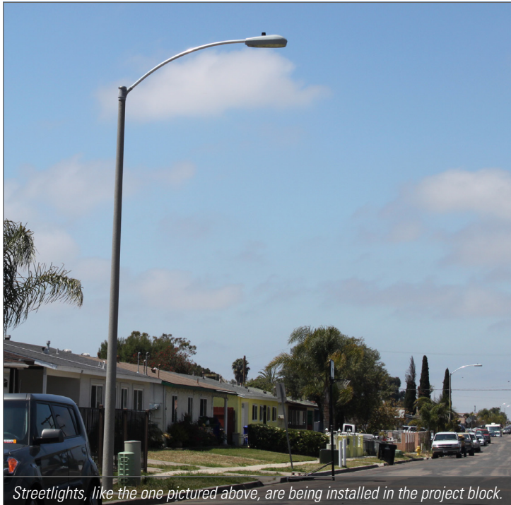
Streetlights, like the one pictured above, are being installed in the project block.