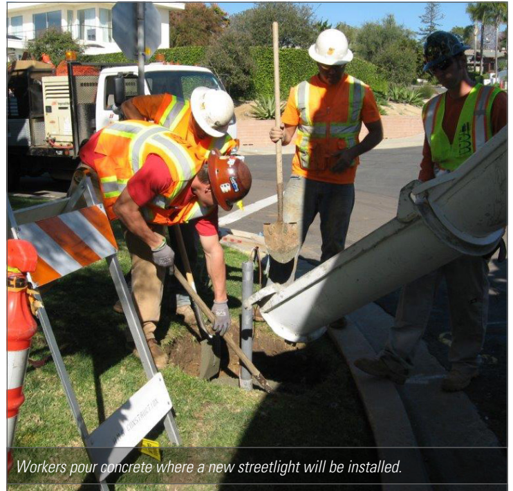
Workers pour concrete where a new streetlight will be installed.

Most of these corrections are minor and are the responsibility of the property owner. Corrections need to be completed before we can cut customers over to the new underground system. Customers who are not cut-over to the new underground system risk loss of service when the overhead system is removed.