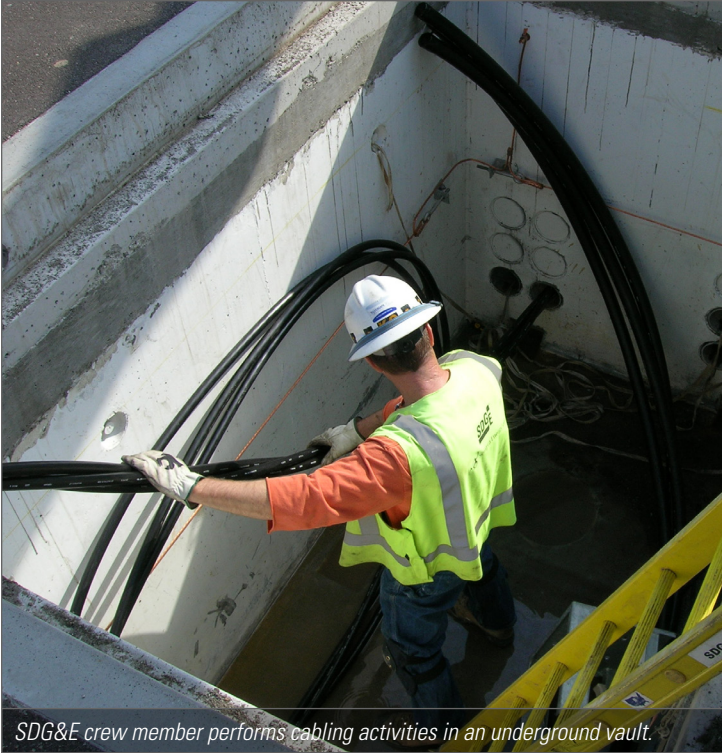
SDG&E crew member performs cabling activities in an underground vault.