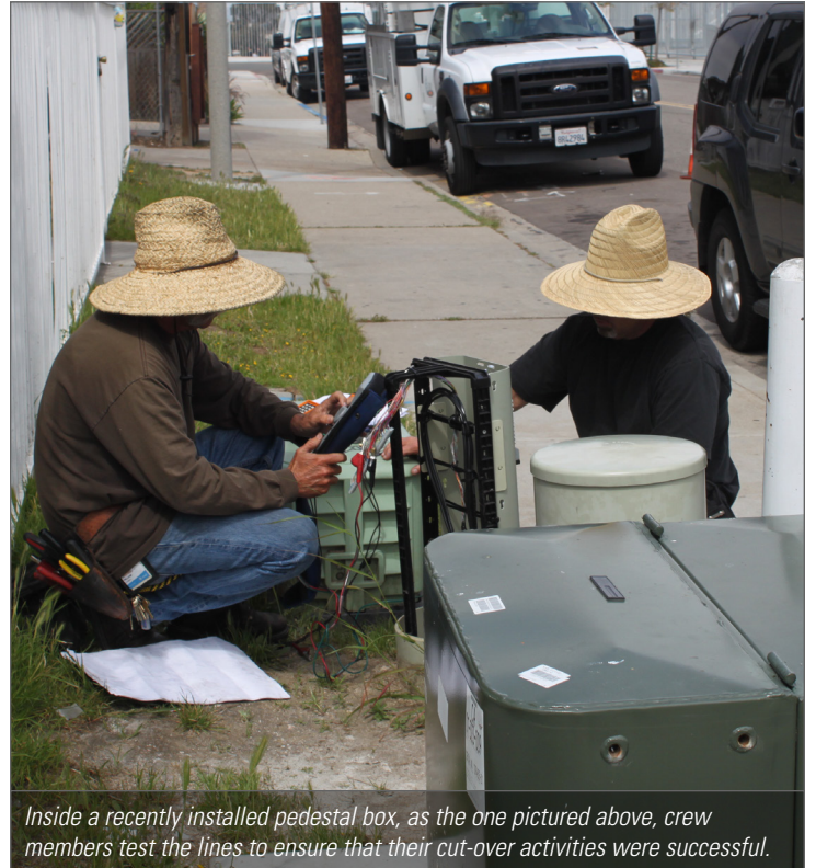
Inside a recently installed pedestal box, as the one pictured above, crew members test the lines to ensure that their cut-over activities were successful.

CORRECTION NOTICES ➤ If you need to make a correction to your property in order to pass final inspection, you will receive a door hanger or letter from a City of San Diego inspector. The door hanger and letter have a description of the correction needed. Please do not delay in contacting the inspector whose name and phone number appear on these notices, so that the problem can be resolved.