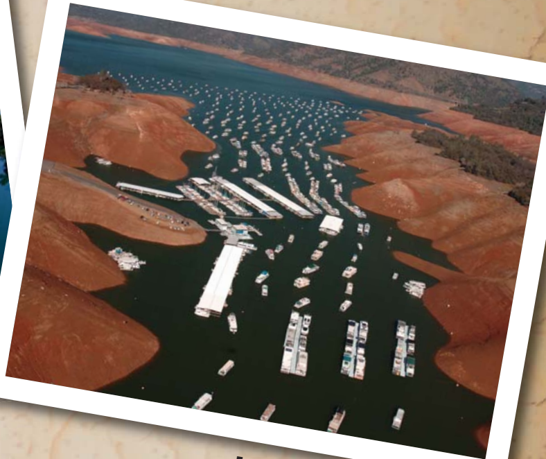
Lake Oroville 2008