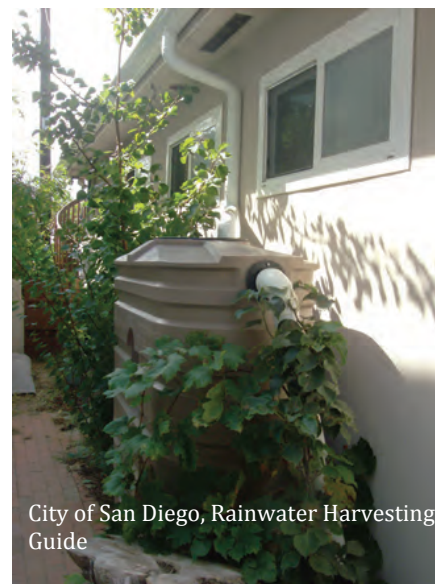
City of San Diego, Rainwater Harvesting Guide

Rain barrels and tanks can help water vegetables in dry months. Calculate how much water the vegetables need to determine the size of the tank.