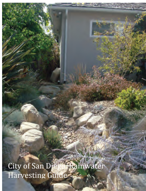
City of San Diego Rainwater Harvesting Guide

absorbs rainwater, keeping soil biology happy and tapped by plants during drier months. Excess water percolates down into aquifers and feeds streams. These aquifers are an important source of drinking water. So here are steps you can take: