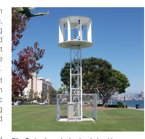
Pilot Project's vertical-axis wind turbine converts

The project demonstration placed a 30-foot tall vertical-axis wind