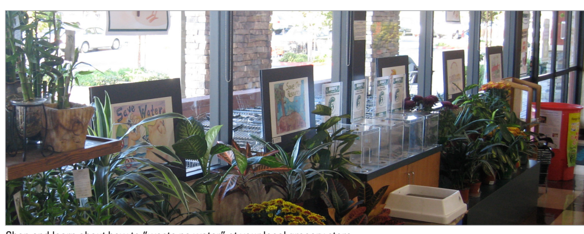
Shop and learn about how to "waste no water" at your local grocery store.

The award-winning Water Conservation Posters, created by our local school children, are just too good and should be shared. That's why your Public Utilities Department is going to put the 19 winning posters on display at local libraries and grocery stores this winter. When you are buying groceries for family meals or checking out a book to read, don't be surprised if you find these posters at your neighborhood locations: