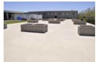
Chlorine contact basin where recycled water is treated with chlorine to kill any remaining bacteria.

This is where the IPR Project begins. It will take the tertiary treated water from the North City Water Reclamation Plant and subject it to a series of advanced treatment processes that will result in water that is said to be nearly distilled water quality. Once it actually begins operations, the Project will spend a year producing and analyzing the highly treated water to determine if it would be feasible for use as a supplement to our water supply. This graphic illustrates the additional treatment given to the tertiary water: