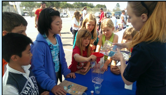
Pure Water staff demonstrated how the water purification process cleans recycled water to Porter Elementary School students (left) and YMCA campers (right).