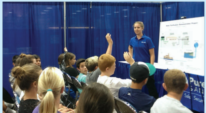
Students from middle schools throughout San Diego County visited the Pure Water booth to learn about water purification.