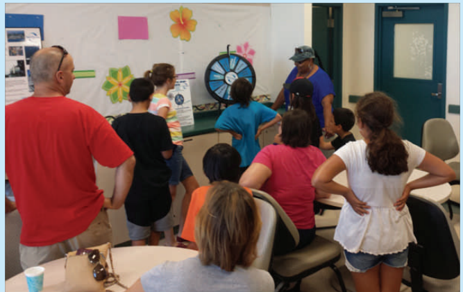
Students toured the Advanced Water Purification Facility to learn about how water can be reused over and over again.