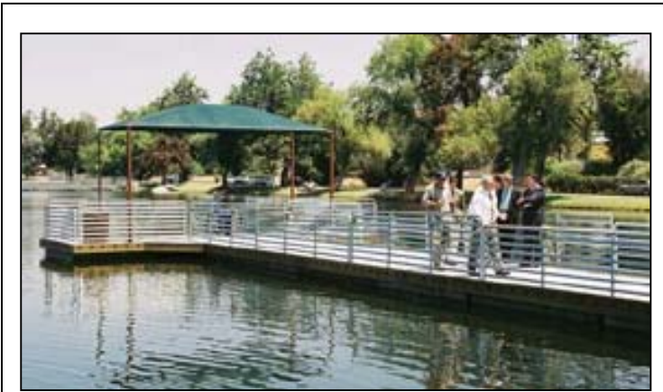
Padre Dam Municipal Water District – Santee Lakes Recreation Preserve uses recycled water.

The remaining non-potable uses of recycled water represent either a much smaller amount of overall reuse potential or an application difficult to implement in San Diego. In general, these opportunities include private residential landscape irrigation, wildlife habitat enhancement (wetlands creation), recreational impoundments (lakes or ponds), and other uncommon or specialized uses.