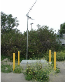
Mission Valley Well

A water resource strategy that includes conservation, recycled water, and groundwater supplies will help meet future water needs.