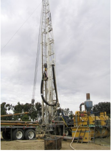
Mt. Hope Drilling Rig

A water resource strategy that includes conservation, recycled water and groundwater supplies will help meet future water needs.