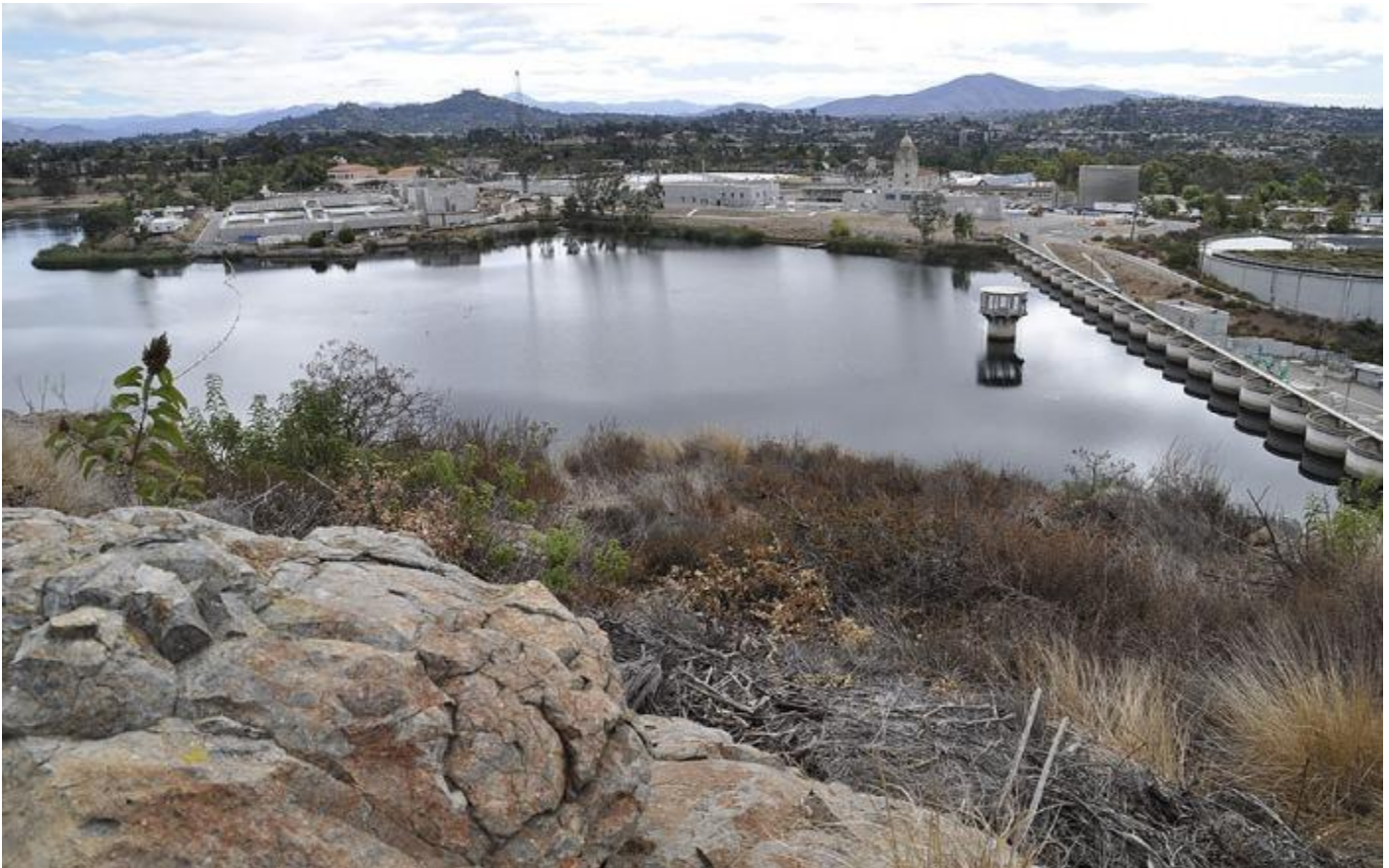
Alvarado Water Treatment Plant next to the dam at Lake Murray

Under the IPR Project, tertiary reclaimed water (which approaches the quality of our raw untreated imported water) would be subjected to the advanced treatment described above. In other words, the IPR Project water would not be very different from what we're importing now, and may possibly be an improvement.