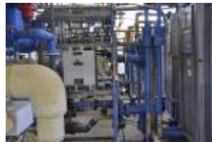
EDR (Electro Dialysis Reversal) area of the plant, where portions of the reclaimed water receive additional treatment for removal of dissolved solids.