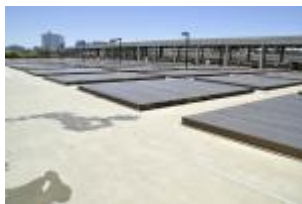
Secondary clarifier, where organic solids sink to the bottom of the tank and are separated from the treated wastewater.