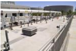
Primary clarifier, where heavy particles sink to the bottom of the tank and are removed.

San Diego has two large water reclamation plants that treat wastewater to tertiary standards. Tertiary water is clean enough to be used for irrigation and industrial applications in San Diego (and has been for many years), but is not considered quite good enough to drink. Here are a few photos from the San Diego North City Water Reclamation Plant (all photos in this article are mine):