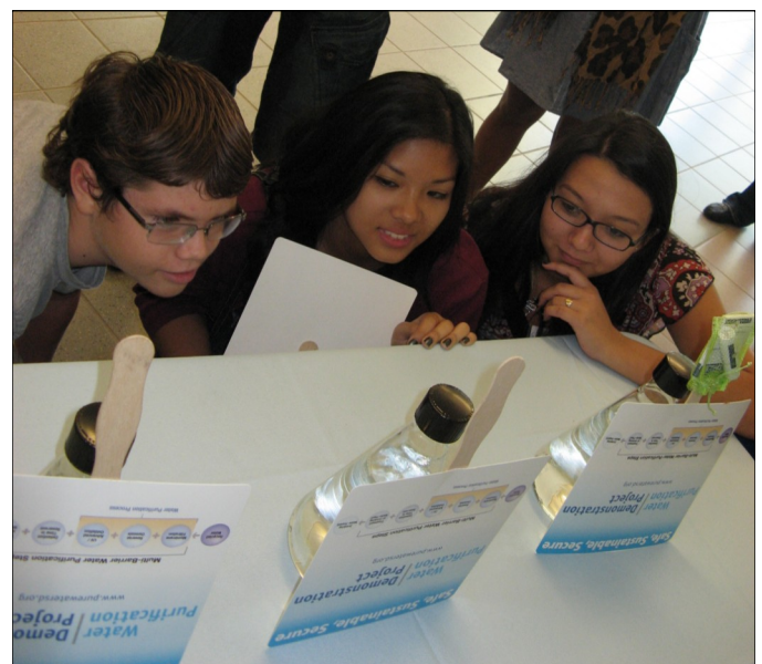
Students from the Elementary Institute of Science compare beakers filled with tap, recycled and purified water.

In early July, elected officials, water agency boards,