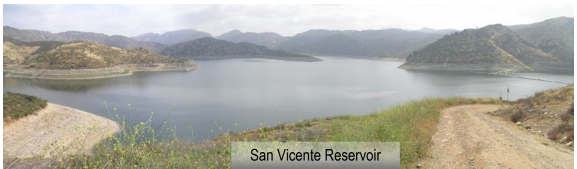
San Vicente Reservoir

...a computer model of San Vicente is being used to determine the behavior of the reservoir and what will happen if purified water is added.