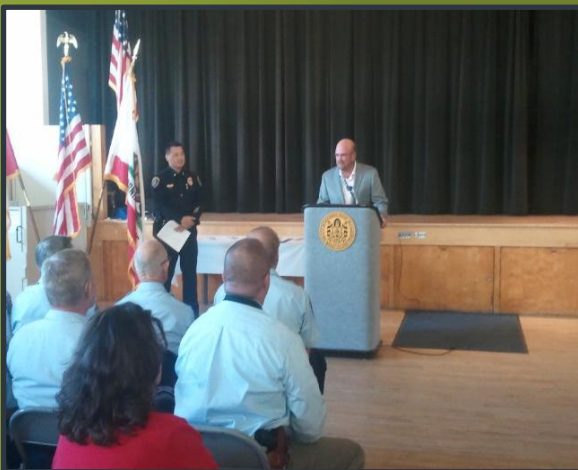
Speaking to the Linda Vista Community Council