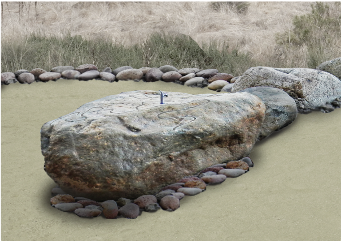
Relationship of artwork to amphitheater and landscape.