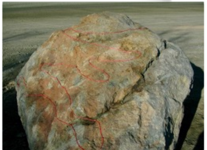
Views of boulder with string sketch indicating planned paths of trail channel carvings.