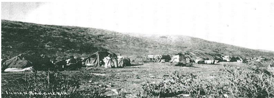
Indian Rancherias near Golden Hill.

Aside from the Indian rancheria, little development occurred in Golden Hill until Alonzo Horton purchased one thousand acres of real estate and