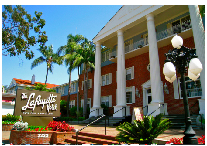
The Lafayette Hotel, originally named Imig Manor, was built in 1945, and is listed on the National Register of Historic Places.