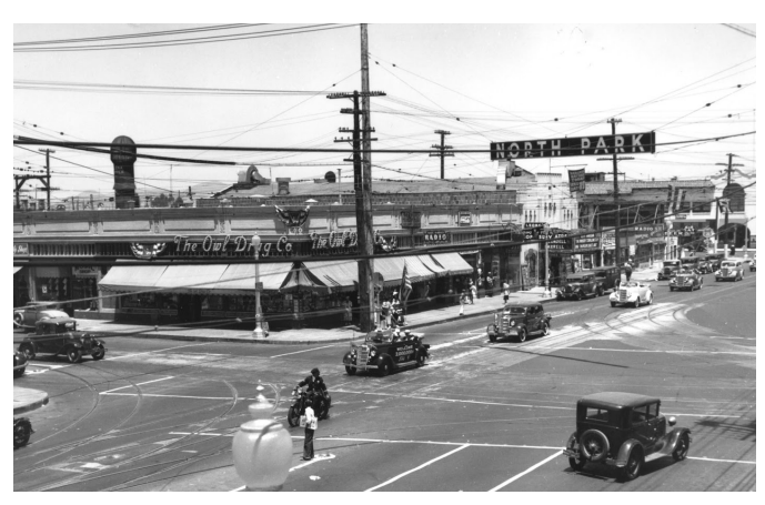
Installed in 1935 above 30th St and University Ave, the North Park Sign is a neighborhood landmark. First replaced in 1949 when the streetcar wires were removed; the current generation of the sign still proudly declares the center of this community.

Along University Avenue, new commercial properties were constructed and existing storefronts were renovated as this area began to shift from a neighborhood retail area to a regional shopping district to compete with the new shopping center in Mission Valley. At the same time, increased reliance on the automobile and local road improvements meant the arrival of new businesses which catered to the needs of the motorist. Auto-related businesses – such as gas stations, car lots, and auto parts stores – began to appear alongside