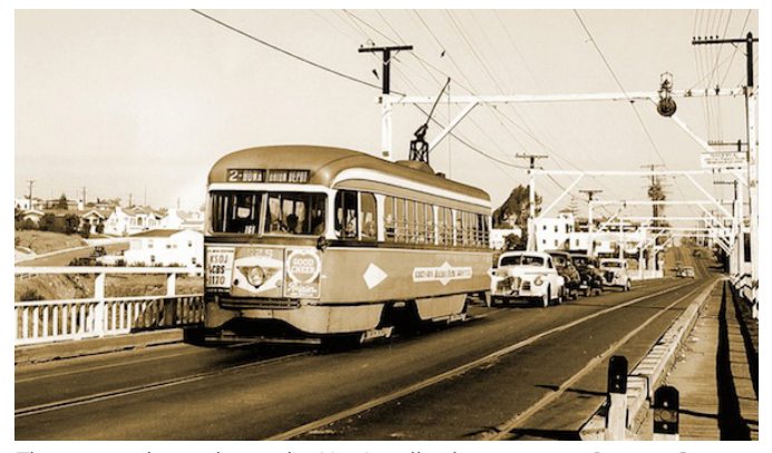
The image above shows the No. 2 trolley line crossing Switzer Canyon during the 1940s enroute to Golden Hill and eventually terminating at Broadway and Fifth Ave Downtown.

In the mid-19th century, San Diego had approximately 650 residents of record and an unknown indigenous population. However, new arrivals were transforming the small Mexican community into a growing commercial center. In 1867, Alonzo Erastus Horton acquired nearly 1,000 acres of land two miles south of "Old Town", where downtown San Diego sits today. Dubbed "New San Diego", Horton orchestrated the creation of a new downtown, relocating the city's first bank, main newspaper, and several government buildings to this site. Thus Old Town was supplanted as the City's primary commercial center. The arrival of the railroad in the 1880s linked San Diego with the eastern United States and sparked its first building boom. By 1887, San Diego's population had spiked to 40,000, and large tracts of new development began to appear on the hills immediately adjacent to Downtown.