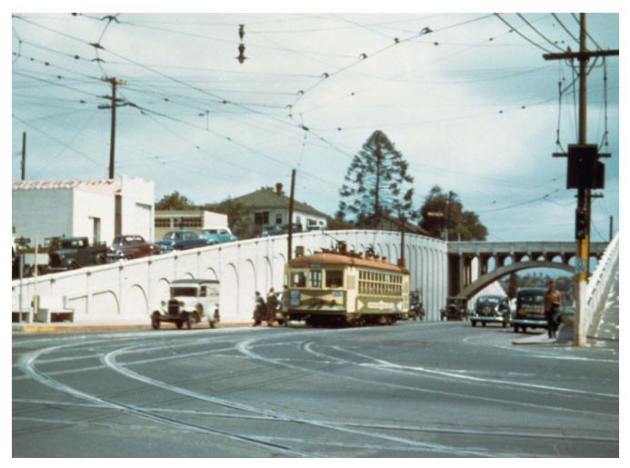
The Georgia Street Bridge, built in 1914, is listed on the City of San Diego Historic Resources Register.

The North Park Historic Preservation Element contains specific goals and recommendations to address the history and cultural resources unique to North Park in order to encourage appreciation of the community's history and culture. These policies along with the General Plan policies provide a comprehensive historic preservation strategy for North Park. The North Park Historic Preservation Element was developed utilizing technical studies prepared by qualified experts, as well as extensive outreach and collaboration with Native American Tribes, community planning groups and preservation groups.