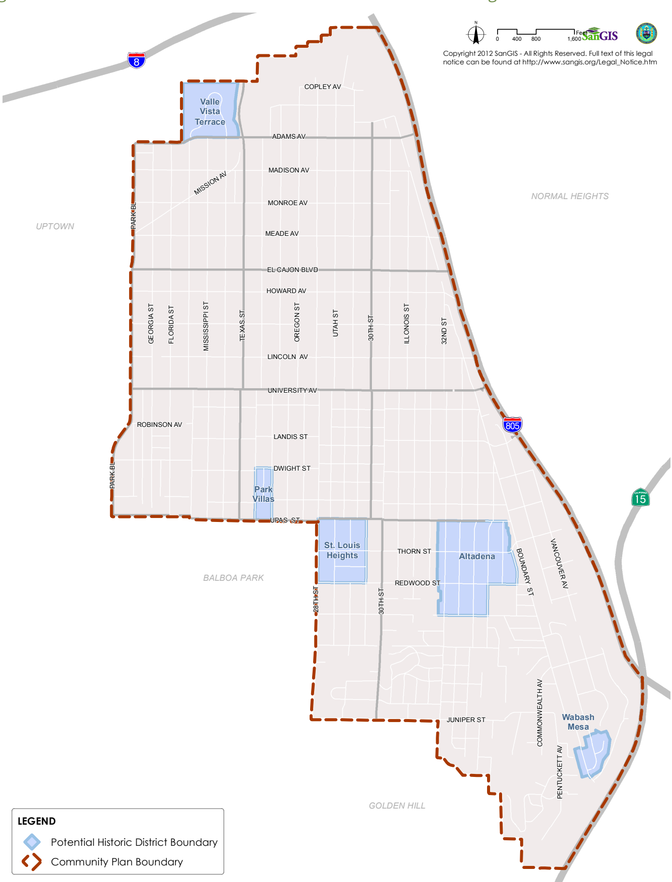
Figure 10-4: Location of Potential Historic Districts Identified During Public Outreach