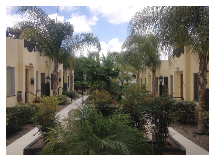
This type of courtyard apartments/bungalow courtyards became a popular form of housing in North Park during its greatest economic building boom that saw the completion of the streetcar system, and the 1915 Panama-California Exposition.

In addition to direct incentives to owners of designated historical resources, all members of the community enjoy the benefits of historic preservation through reinvestment of individual property tax savings into historical properties, and an increased historic tourism economy. There is great opportunity to build on the existing local patronage and tourism base drawn to the community's neighborhoods and shopping districts by highlighting and celebrating the rich history of North Park.