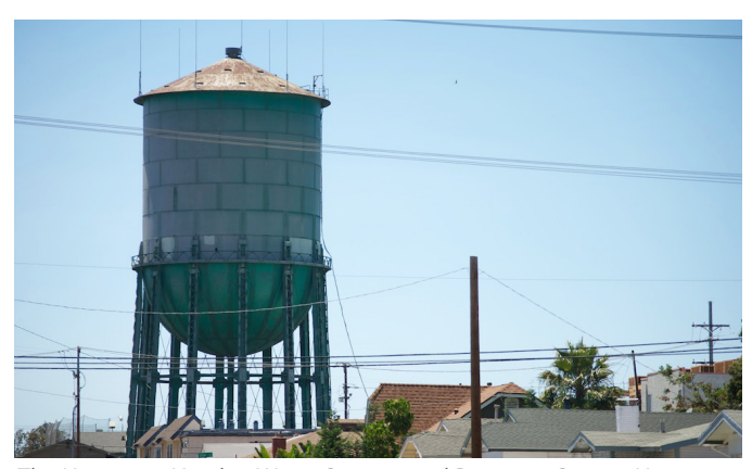
The University Heights Water Storage and Pumping Station Historic District is listed on the National Historic Register of Historic Places.

Substantial civic and institutional development took place in North Park throughout the 1920s. During this period, the community received its first localized branches of public services, including a fire station and a post office. Several educational facilities were established, including Park Villas Elementary School and Jefferson Elementary school, as well as two private