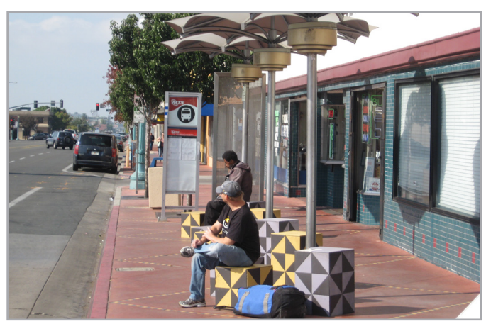
Public art can promote transit use as well as community pride.