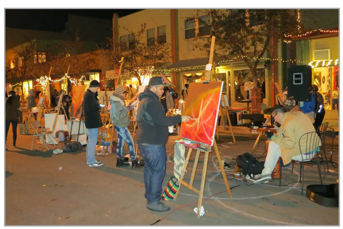
Ray street which as at the center of north park's art district, hosts gatherings of local and nationally known artists, galleries and artrelated events and venues.

The North Park Community Plan redefines the relationship of art to urban space as an integral part of the urban infrastructure and the natural environment. This Plan seeks to make North Park's commitment to excellence in design, architecture, and art readily apparent. By committing to a diversity of artists and public artworks of undisputed quality and excellence as integral to the success of its comprehensive planning effort, North Park assumes a leadership role as a forward-looking, progressive neighborhood, dedicated to defining a unique sense of place.