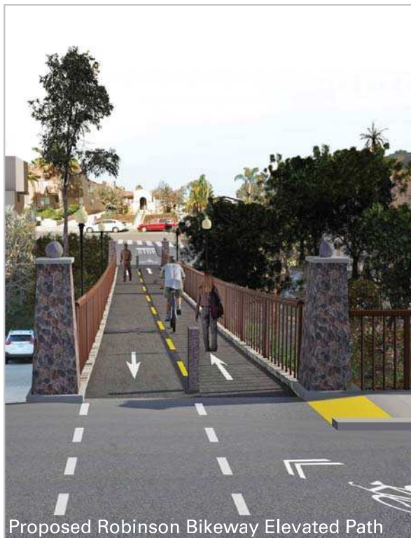
Proposed Robinson Bikeway Elevated Path