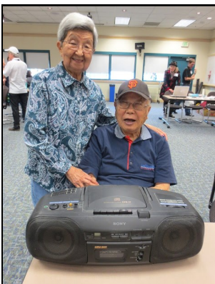
Fixit Clinics can bring life back into broken possessions.

In order to promote recycling and encourage tinkerers and repairers of all types, the San Diego Central Library is hosting a series of Fixit Clinics in 2016. During these clinics, participants can repair or rehab anything they own that needs some fixing up, from electronics to toys to clothes.