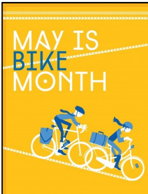
Mini-grants are available for programs that encourage biking.

Although National Bike Month isn't until May 2016, the SANDAG iCommute program is offering mini-grants of up to $3,000 for programs that educate, promote and encourage biking as a viable transportation choice. A total of $30,000 will be available for awards.